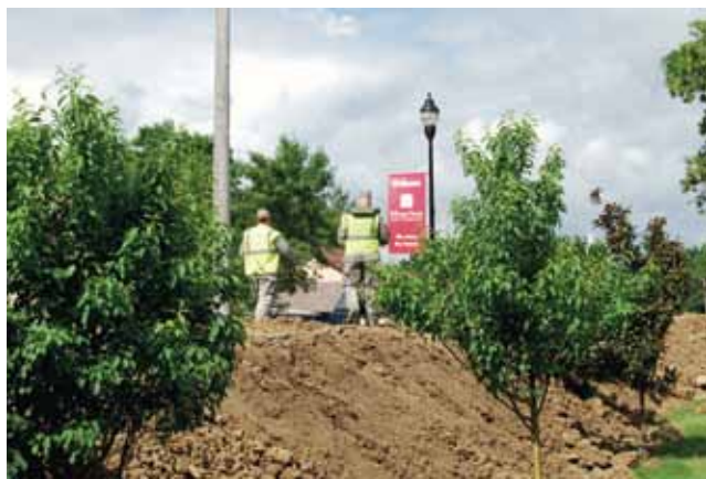
National Guardsmen patrol the dike along the south perimeter of campus on University Avenue.