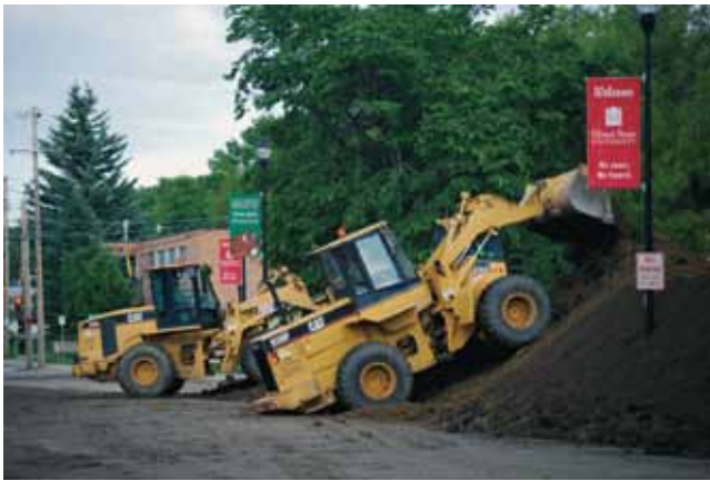
Construction crews work tirelessly to complete the "Beaver Dam."

And when the flood of 2011 tried to claim our environment, the Beavers did not back down. The result is a campus strong and determined that is ready to face any challenge.