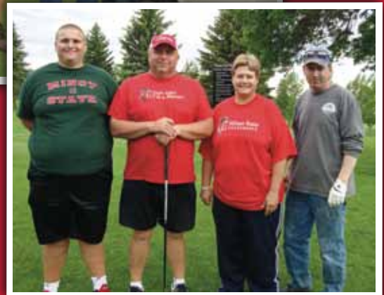
Our guests from Rugby provided a great tour stop.