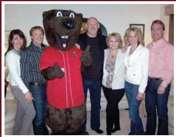
The third annual Progressive Dinner was another enjoyable evening with an appearance by Buckshot!