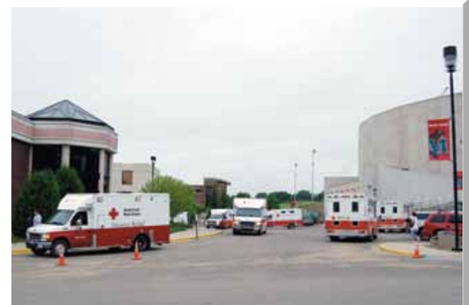
Hundreds of Red Cross volunteers from around the nation responded to the community's needs.