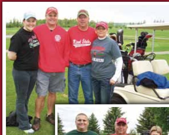
Another successful turnout at our first golf stop in Velva.