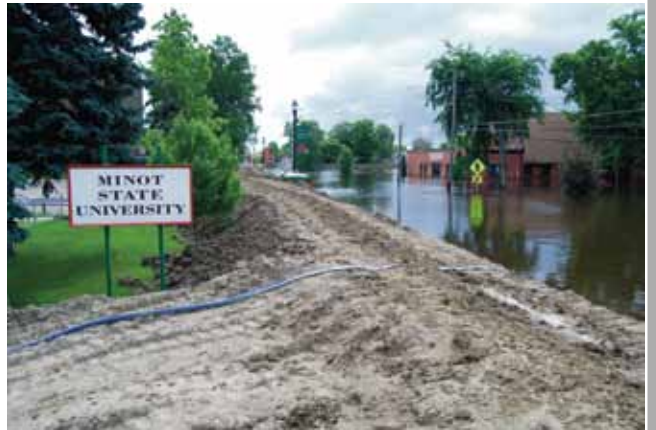
MSU's "Beaver Dam" accentuates the delicate contrast between safety and harm from the flood waters.