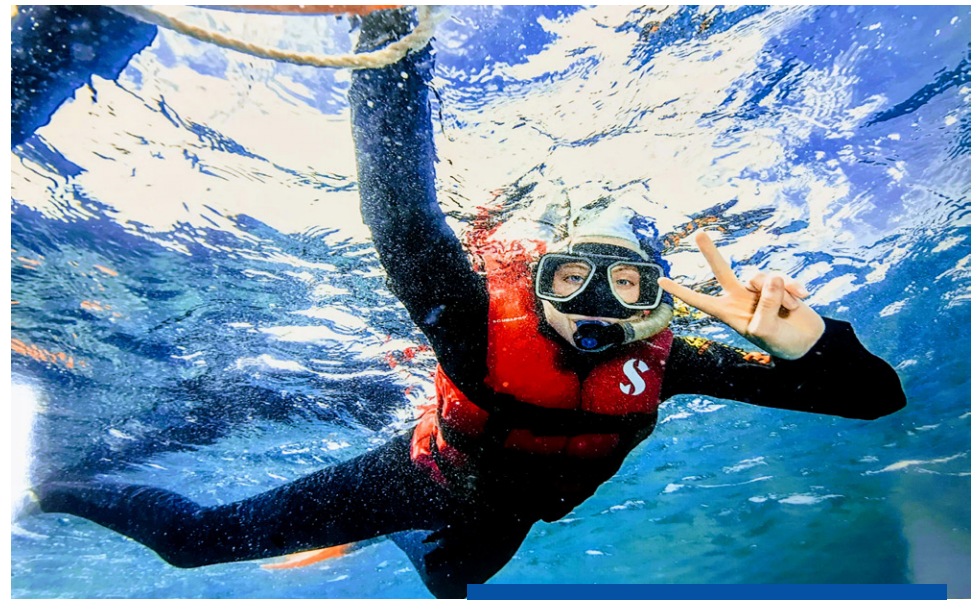
Snorkeling at the Great Barrier Reef

I chose to study in Australia through International Studies Abroad (ISA) since there would be no language barrier, and I would have ISA support staff in my city.