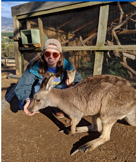
Below: Hanging out with a kangaroo at the Bonorong Wildlife Sanctuary