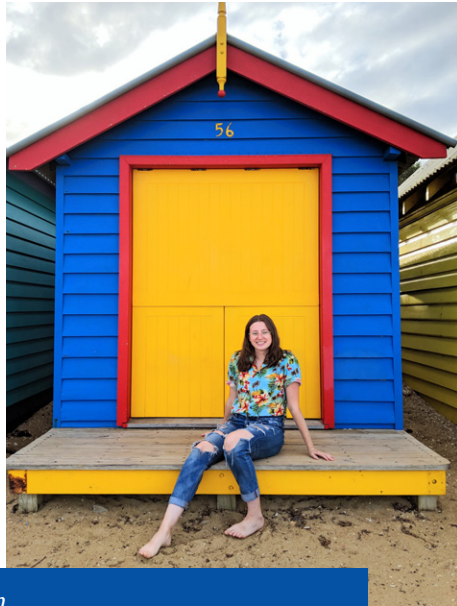
Above right: Bathing box at Brighton Beach

I decided to study abroad after the study abroad coordinator came into one of my classes and spoke about it. I never really thought I could study abroad until that. Then I realized that I would never be able to fit such a long period of travel into my life as easily as I would be able to during my college time while I don't have any serious commitments.