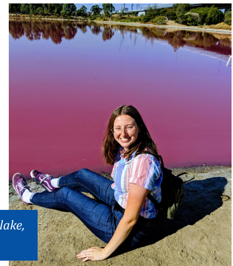
Westgate Park boasts a pink lake, due to algae and bacteria

Do it! No matter your major, there is a program that will work for you. You will never have the opportunity to study and travel as freely as you will be able to while studying abroad in college.